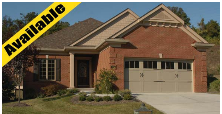
839 Whitewood Court

■ Available Landonium Lots in Squire Valley