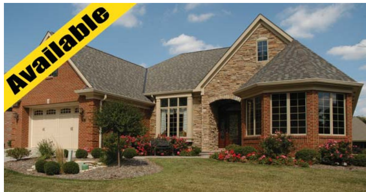
803 Woodside Court ("Home for the Holidays" Home)